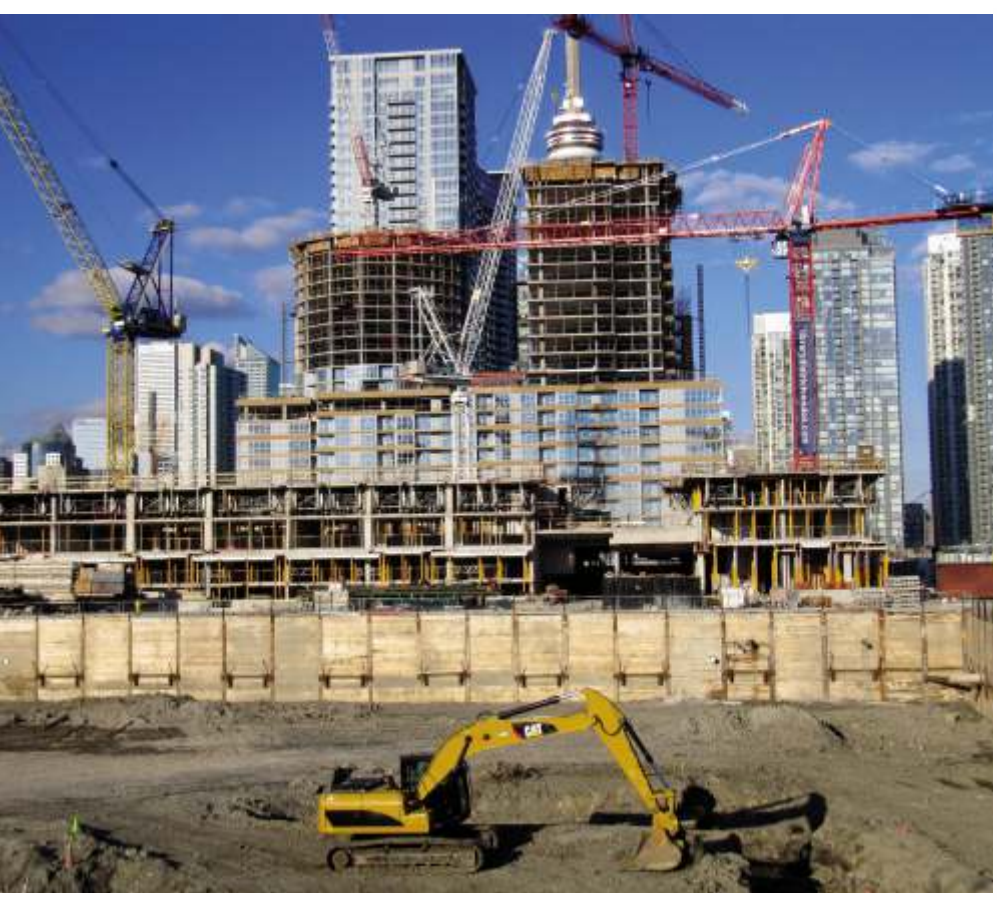
Engineering . Construction . Project Management